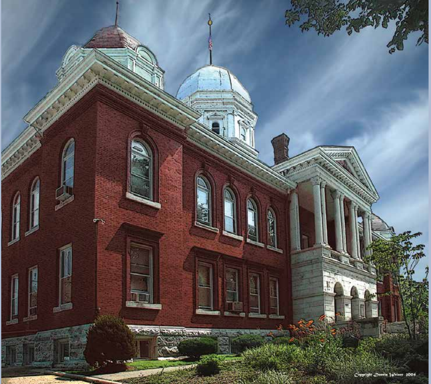
Gasconade County Courthouse, Hermann, MO